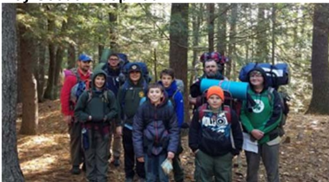
Troop 136 - Hiking at Pawtuckaway State Park

Fall is in the air and the Scouts of Troop 136 are gearing up for a busy November and December. They started out their season selling Popcorn at Walmart and now to their neighbors. They're also selling Yankee Candles. The fundraising helps the Troop with funds for multiple awards, activities and much needed supplies. On