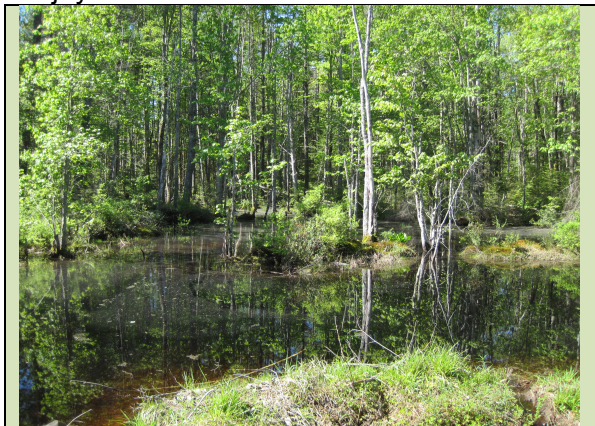
This was once a rutted, degraded ATV pit. Through careful restoration, it is now a functioning wetland.

May 20 th was a big day to celebrate the rebirth of nature: the Southeast Land Trust (SELT) held a ribbon cutting ceremony at the Mast Road Natural Area in Epping. This 531 acre property has been transformed and is starting its new life as a nature-lover's haven. It features outstanding ecological diversity and an easy walking trail from which to enjoy it.