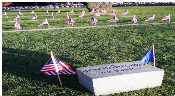
NH graves at Soldiers' Cemetery in Gettysburg

The Civil War Roundtable of New Hampshire's welcomes anyone with an interest in the American Civil War who would like to be with others who share the same desire to learn more of this time in American history. We are an informal club with the only requirement being a Civil War enthusiast. If you or a friend has an interest in the American Civil War, we invite you to come check us out.