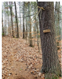
Final Folsom Trail completed

Not surprisingly, trails were popular this year as folks got outside and escaped from their screens. The fifth and final trail at Folsom Conservation Area was completed and is well used by mountain bikers.