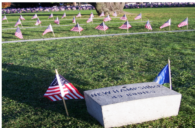
NH graves at Soldiers' Cemetery in Gettysburg

The CWRT of NH meetings of January and February 2021 are CANCELED! We hope to resume meetings in March 2021.