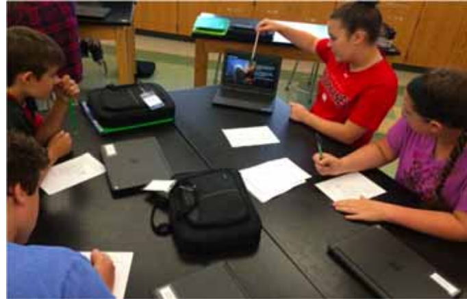
Grade 8 students present to their peers during Science class.

Students have the ability to take these devices home, do research, presentations and much, much more!