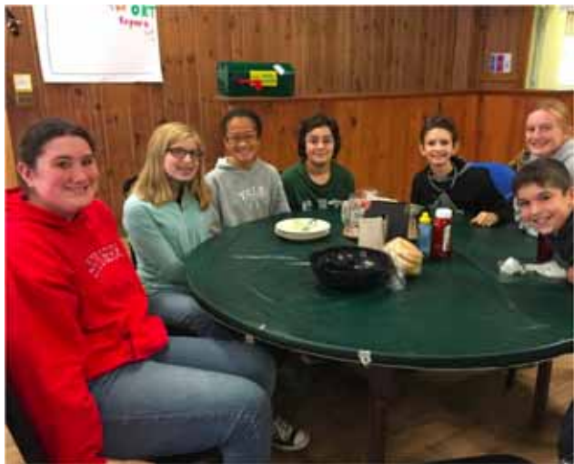
Grade 7 students enjoy their first meal at Nature's classroom October, 2016.

Nature's Classroom is a residential environmental education program. After spending four days and three nights at Nature's Classroom, living and learning together, seventh grade students develop a sense of community, a confidence in themselves and an appreciation for others that will carry over to our school community.