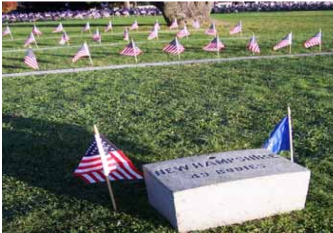
NH graves at Soldiers' Cemetery in Gettysburg

The Civil War Roundtable of New Hampshire's new season is underway. We welcome anyone with an interest in the American Civil War and would like to be with others who share the same desire to learn more of this time in American history. We are an informal club with the only requirement being a Civil War enthusiast.